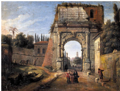
Figure 2: View of the Arco di Tito by Gaspar Van Wittel (oil on canvas, 1710)

Vespasianus' son Titus (79-81 A.D.) built not far from the Colosseum a one fornix arch: we can still see it on the top of Via Sacra at the entrance of Foro Romano . The inscription on the top and the decorated panels inside celebrate the capture of Jerusalem: they represent the victorious army entering Rome with the booty from Jerusalem symbolized by seventh-branched candelabrum. However only the panels and the inscriptions date back to the 1 st century A.D. In the 13 th century the arch was incorporated in the Frangipane's fortification 1 and so remained until the beginning of 19 th century when architect Giuseppe Valadier de-