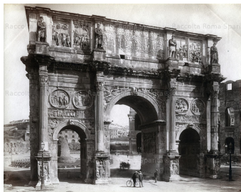
Figure 3: Arco di Costantino as it looked at the beginning of the last century.

The last monument erected in the valley near the Colosseum was Constantine's arch. It dates back to 315 A.D. when Constantine (the 1 st Christian Emperor) built it to celebrate his victory against his rival Maxentius . It is a three fornices-shaped arch, 21 meters high, made by white and colored marbles. Most of the decorations were not made for the arch but were grabbed from 2 nd century imperial monuments. Undoubtedly Constantine won the war, but it was not Augustus time when the empire reached its maximum richness. At Constantine time the empire and the Emperor were "broke", so why should money be spent for new decorations if older ones could be re-used?