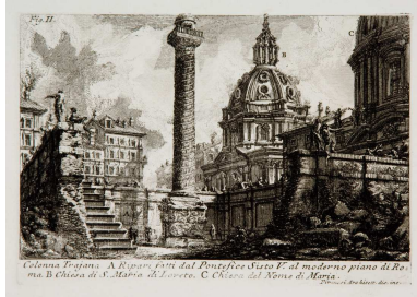
Figure 6: Trajan Forum as represented by G.B. Piranesi (Aquatforte, 1756)

When Emperor Trajan (98-117 A.D.) claimed his own Forum , there was no room left in the district. However in the ancient Rome there was nothing that an Emperor could not do, so Trajan flattened the hill on the side of Augustus' Forum, the Velia , and created enough space for his monumental square. The inscription on the column raised on the north-western side of the Forum celebrate the huge flattening works and reminds that the column is as tall as the erased hill. The frieze on the column represents scenes from the war against Daci , a population from central Europe, likely the present Romania. According to the tradition, the sculptor of the frieze had his inspiration from the scrolls preserved into the latin and greek libraries, erected on the right and left side of the column respectively.