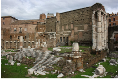
Figure 5: View of the Augustus Forum taken from via dei Fori Imperiali

Mars Ultor 4 was erected to commemorate Augustus' victory over Caesar's murderers. The temple has the same style of Venus Genetrix's one: it's set on a high platform, had 8 Corinthian columns on the front and 8 on both lateral sides; inside there were the statues of Mars and her lover Venus 5 . The decorations concerned the mythical origins of Rome and of its Emperor. But that wasn't enough for Augustus: he placed in the arcades statues of Romulus , Enea and their offspring to recall the ancient origins of the city and to propose himself as the new founder of the Empire. The focal point of the square