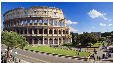
Figure 1: View of the Colosseum from Belvedere Cederna (upper level exit subway Metro-B)

The Colosseum is an elliptical-shaped arena, 50 meters high and has three levels, each one made of 80 travertine arches. The arches are surrounded by Doric semi-columns on the 1 st level (smooth, round capitals), Ionic semi-columns on the 2 nd level (volutes decorate the capitals), Corinthian semi-columns on the 3 rd level (capitals are decorated with scrolls, acanthus leaves and flowers).