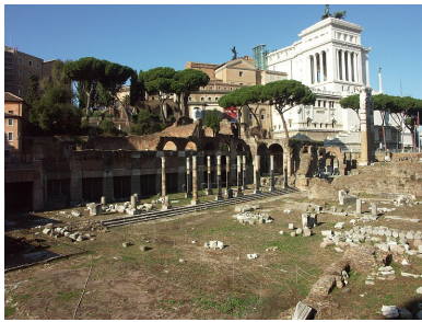
Figure 4: View of the Cesar Forum; in the background the “white” monument of king Vittorio Emanuele II facing Piazza Venezia (informally known as “the typewriter” among roman people).

At the center of the square a bronze statue of Caesar riding his horse was erected. Along the south side of the portico some tabernae (small shops) and thermopolia (an ancient take-away!) were built.