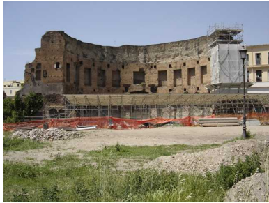
Terme di Traiano - Roma Italia

Figure 8: Trajan baths as they appear now. Note in the background few windows in a “yellow” building, the present Faculty of Engineering.